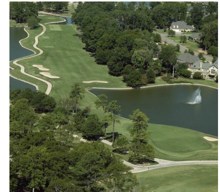
Partial View of golf course at Wynlakes